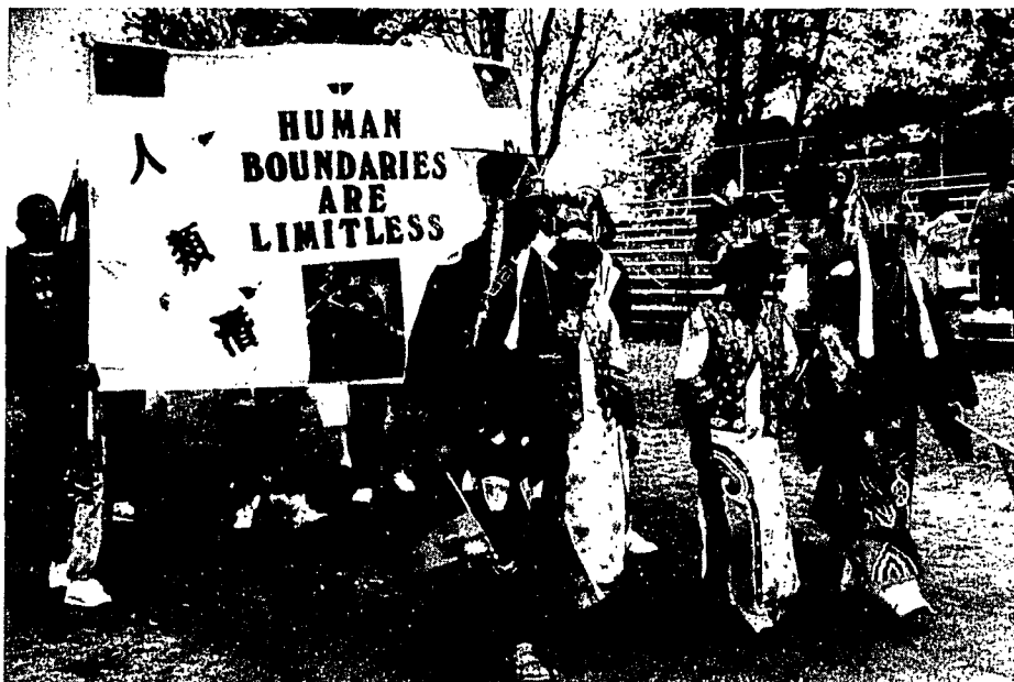
Lincoln's Chinese Club participated in the Homecoming Parade with a banner that expresses the essence of the University—"Human Boundaries Are Limitless."