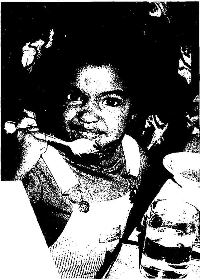
Future Lincoln alumna?