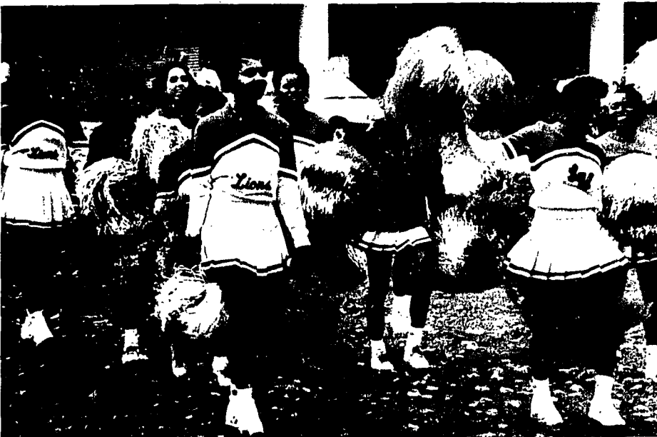
The LU cheerleaders brought Lincoln spirit to alumni, students, and friends in the Homecoming Parade on Saturday, October 22.