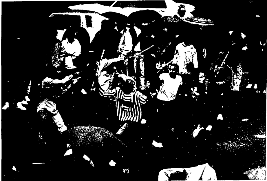
The brothers of Kappa Alpha Psi were among those entertaining the crowd at the Greek Step Show, despite bad weather.