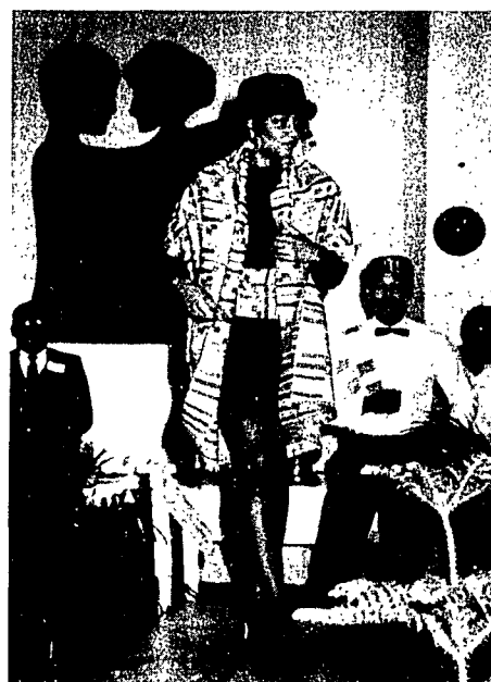
One of the highlights of Homecoming afternoon was a fashion show featuring regional designers as part of "Philadelphia Dresses the World."

8. Production of a new alumni directory—by December, 1989.